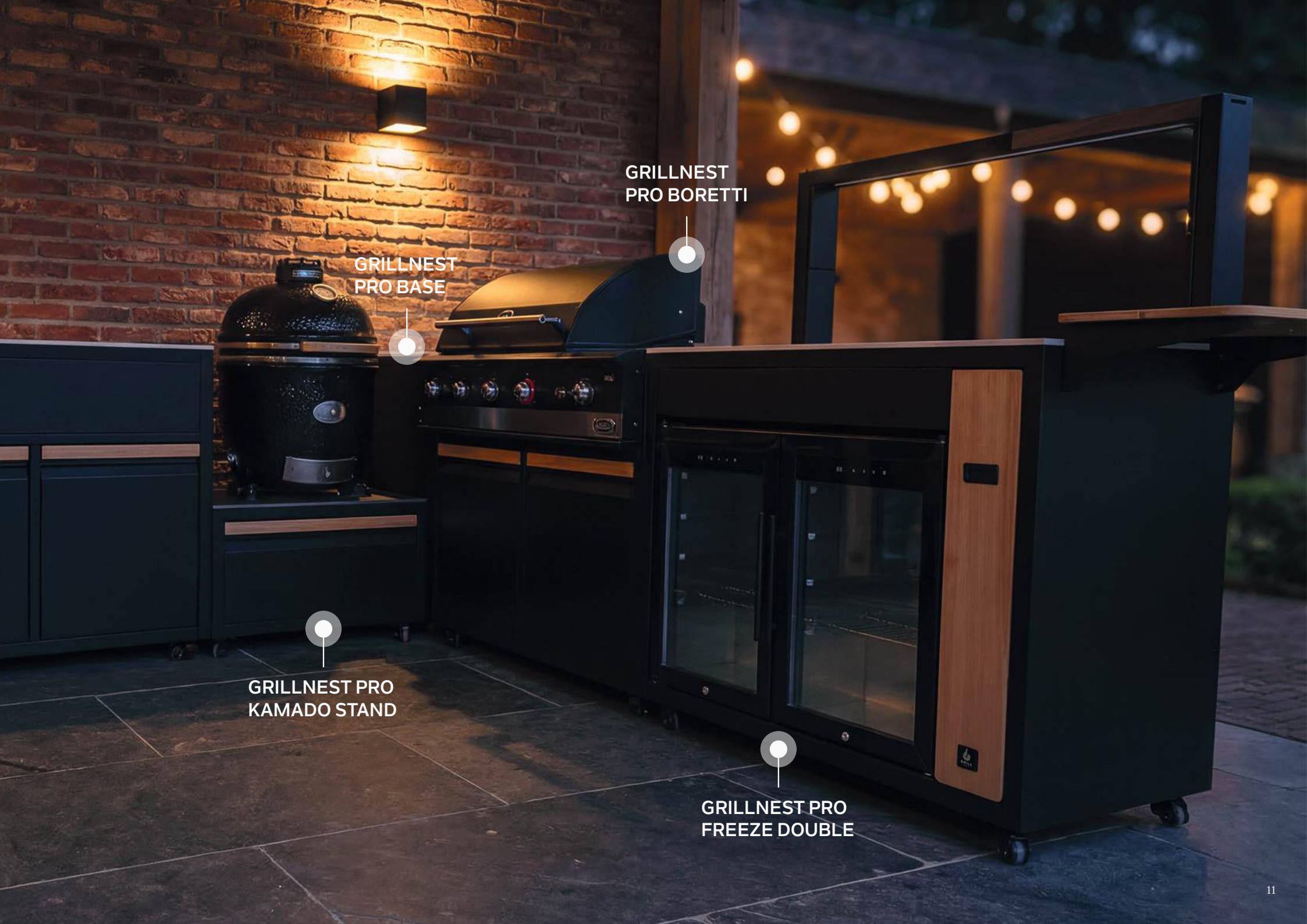
GRILLNEST PRO BORETTI